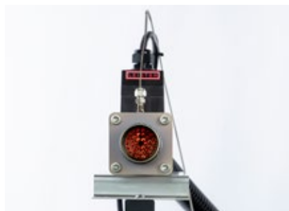
Air heater with large air volume