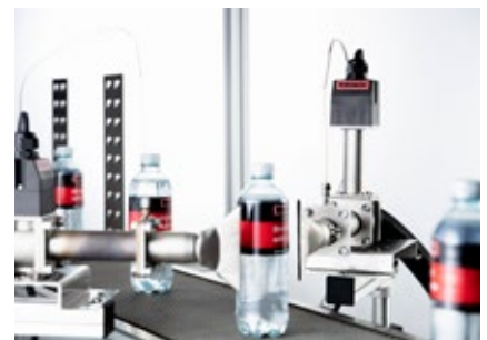
Ceramic inside protects against overheating