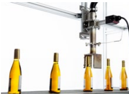
Easily integrated into industrial processes

The small air heaters with flanges on both sides can be easily integrated into industrial piping systems. The serie DF-R is suitable for processes in which hot air recirculation is required.